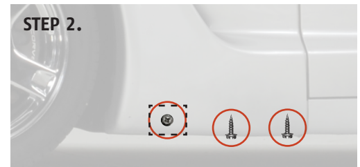
Three screws need to be removed; two vertical and one horizontal.