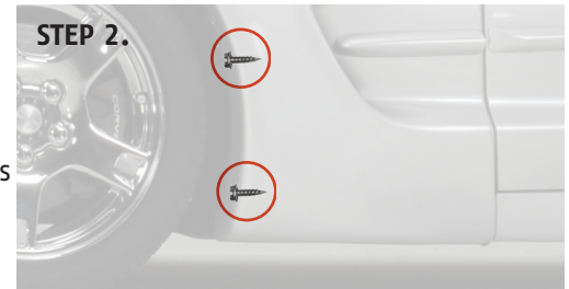
Two screws need to be removed

Install vent grille in place and press into place with hands. Keep applying pressure to make sure grille is bonded securely. Reattach the inner fender deflector, then the fender well, and don't forget the three screws under the fender. Repeat for the other side.